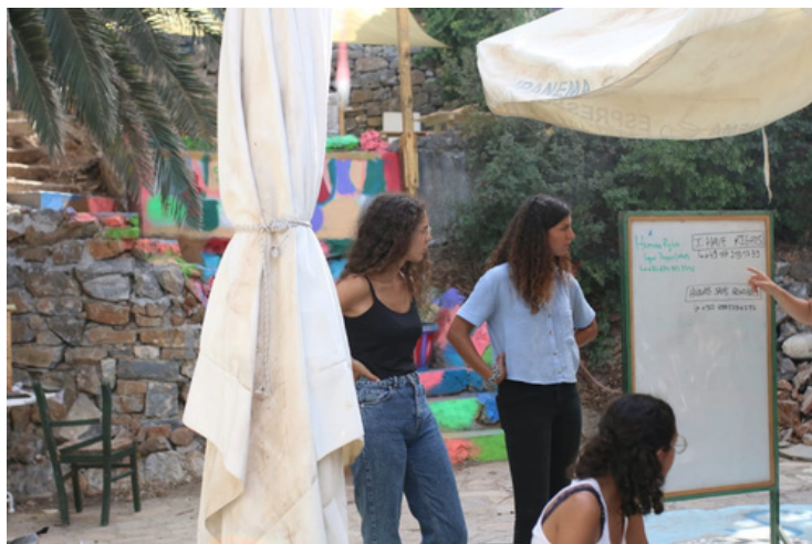
A workshop organised by the Samos Legal Centre

“The interview went well. The waiting was very hard, because I couldn’t work or do anything to distract myself. And I was still in pain, so I was happy when they finally transferred me from Samos, and it helped a lot that you gave me contact information for lawyers where I am now. I’m thankful for the support, it helped me understand exactly what the interview would be like, because the preparation matched the interview questions.”