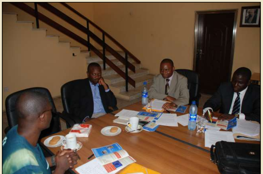
Work session with the project partners Lagos, April 2009

European Commission Anti-torture Campaign