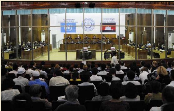
17 February 2009: opening of the first trial before the Extraordinary Chambers in the Courts of Cambodia, in the presence of voluntary LWB France lawyers

In partnership with and in accordance with the wishes of the Royal School of Magistrature, actions to strengthen the capacities of magistrates with regard to the use of human rights rules and the new penal procedure code will also be implemented.