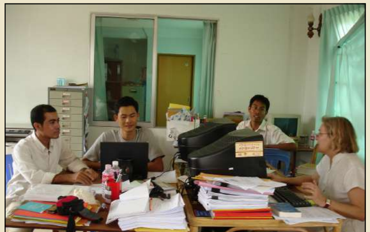
2009: French and Cambodian lawyers at the LWB France Head Office at Phnom Penh