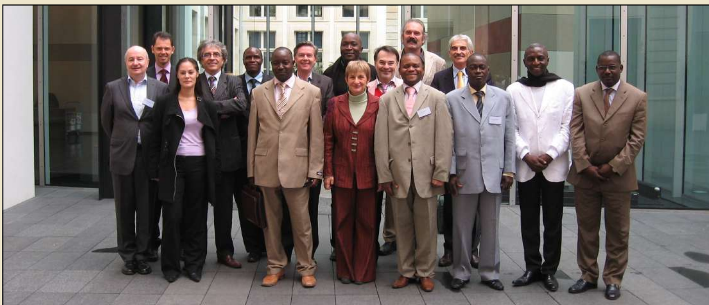
First meeting of the LWB associations, on 6 and 7 November 2009 in Paris, on the Clifford Chance premises: LWB Brazil, LWB Cameroon, LWB France, LWB Guinea-Conakry, LWB Italy, LWB Mali, LWB Mauritania, LWB Sweden and LWB Switzerland

The project was launched during 2009. In 2010 the actions of the project will be implemented.